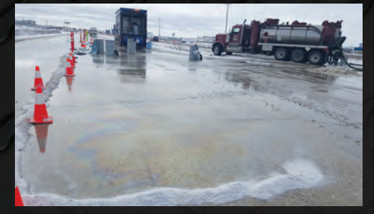
Diesel spill on roadway