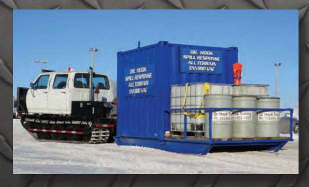
Off Road Portable Vac Unit

Our people are equipped with the latest equipment, technology and training. With one phone call you can rest assured that your Spill whether on the road or at your facility will be handled efficiently and expediently by our Response Team. We are available 24 / 7 / 365 on a moment's notice.