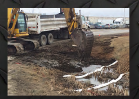
Diesel spill remediation