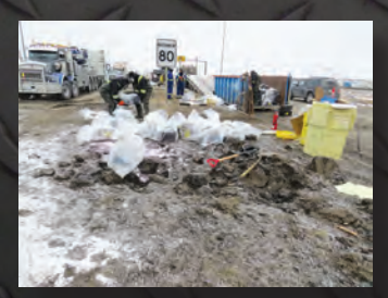
Class 8 Hazard: Battery Cleanup