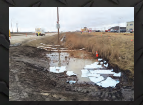
Diesel spill in ditch