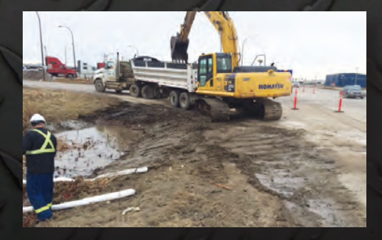
Spill site restoration