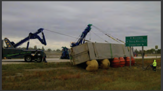
Uprighting Trailer Full of Manitoba Walleye