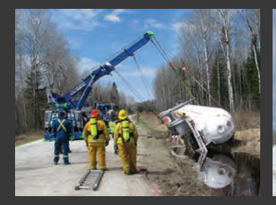
LPG Tanker Recovery