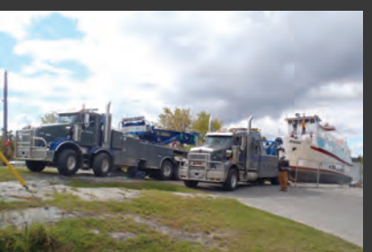
MS Kenora Inspection Winch Out