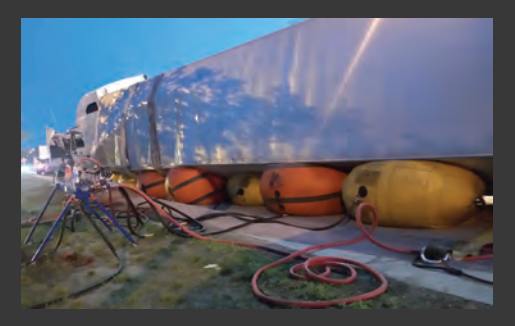
Peat Moss Air Cushion Uprighting