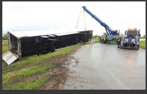
Exit Ramp Tractor Trailer Recovery