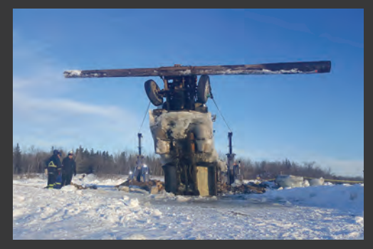
Winter Road Lake Recovery