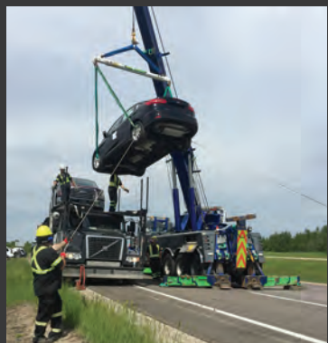
Rotator at its Best