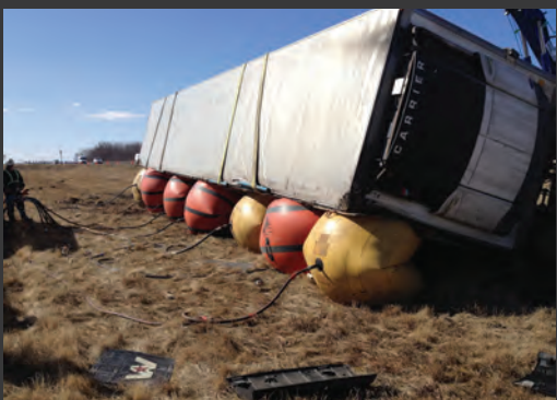
Air Cushion, Upright Loaded Trailer of Pork