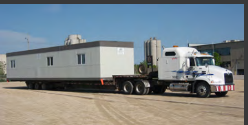
Modular Space Unit Transport