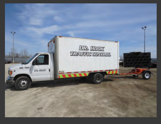
Traffic Control Unit