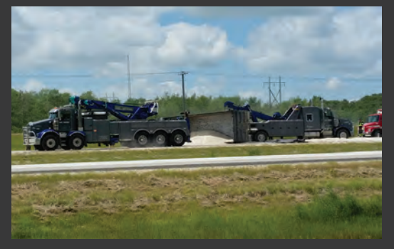
Upright Overturned Gravel Truck and Trailer