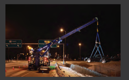
Porsche Off Road Recovery