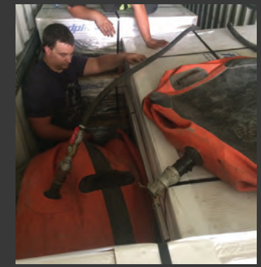
Load Shift Inside Van Trailer