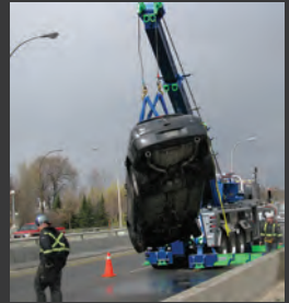
Overpass River Recovery