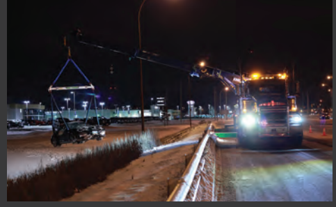
Porsche Rotator Recovery