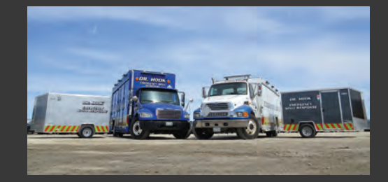
Spill Response Units