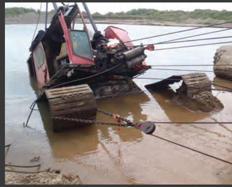
Rigging for the Load