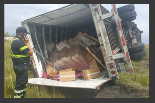
Cargo Off Loading