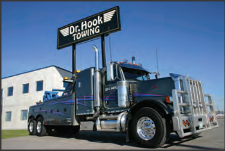
Heavy Tow Unit #6