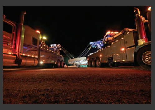
90,000 Lb. Excavator Recovery