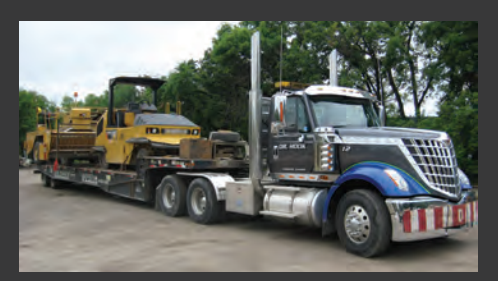
Tilt Trailer Transport