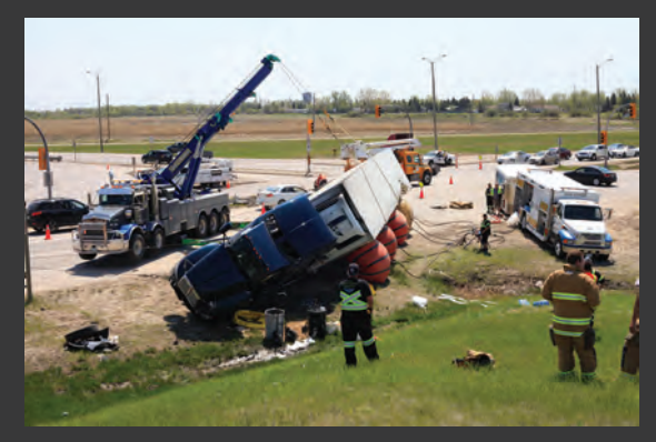
Air Cushion, Spill Response for Loaded Truck and Trailer