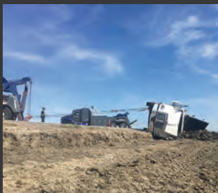
Side Dump Trailer Overturned