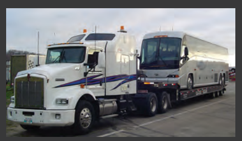
Motor Coach Transport