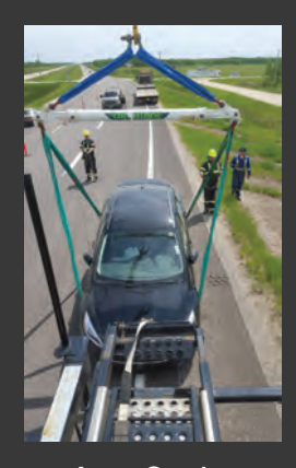
Auto Carrier off Load