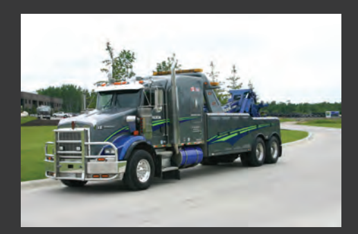
1 Of 13 Heavy Tow Units