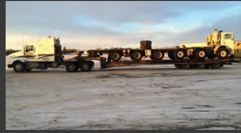
Tilt Trailer Transport