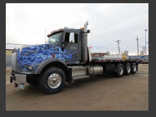
Tri Drive Tilt Deck

1-800-561-4665 204-956-4665 www.drhooktowing.com