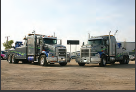
2 Of 13 Heavy Tow Units