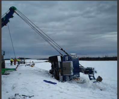
Winter Road 5 Axle Crane Recovery