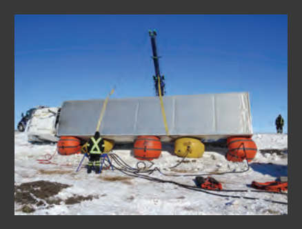
Winter Air Cushion Recovery