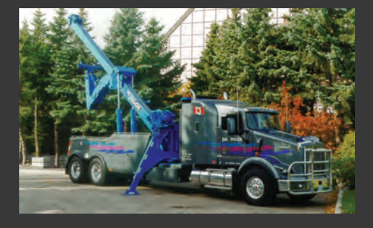
50 Ton Side Puller