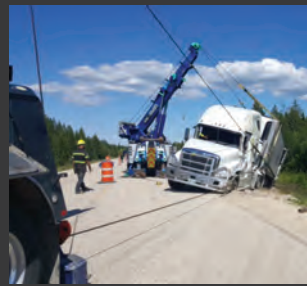
Tractor and 2 Loaded Trailers Air Cushion Uprighting