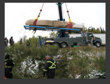
Cargo Recovery From Ravine