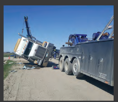
Over Turned Gravel Truck and Trailer