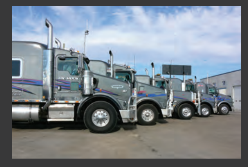
5 Of Our Best Heavy Tow Units