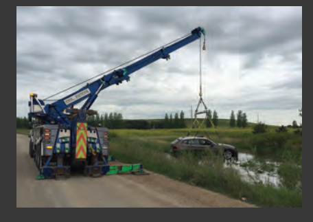
Rotator Fishing Once Again