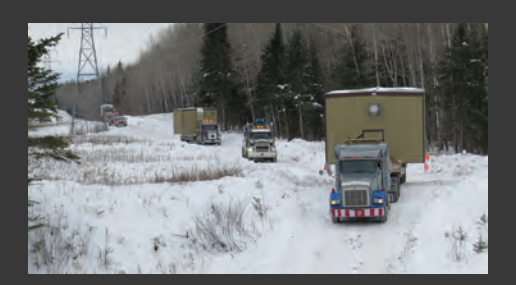
Winter Road Convoy