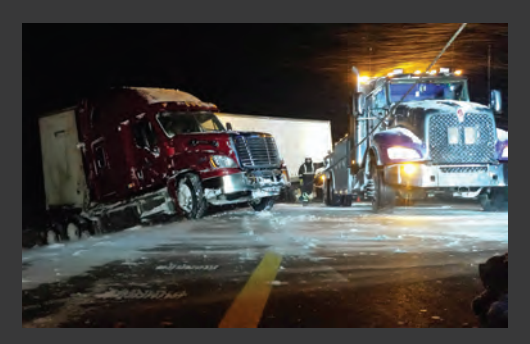
Jack Knife Storm Recovery