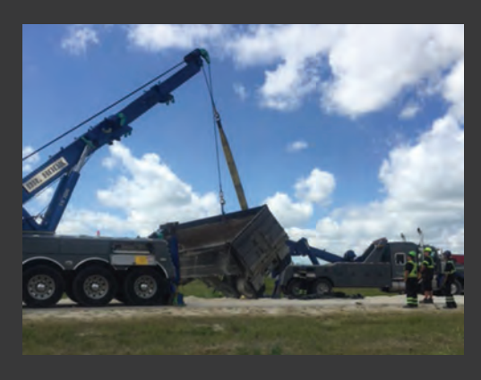
Rotator Upright of Gravel Truck and Trailer