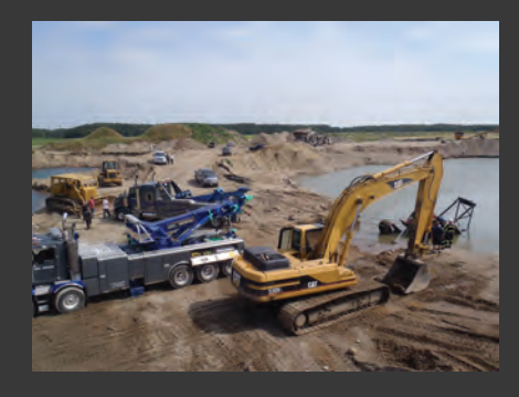
90,000 Lb. Dragline Recovery From Gravel Pit