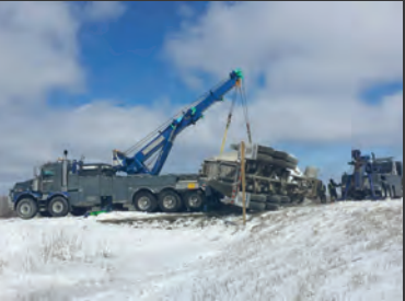
Loaded Concrete Tanker Recovery