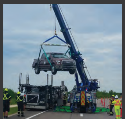
Auto Carrier off Load