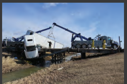
Spill Responce and Heavy Recovery