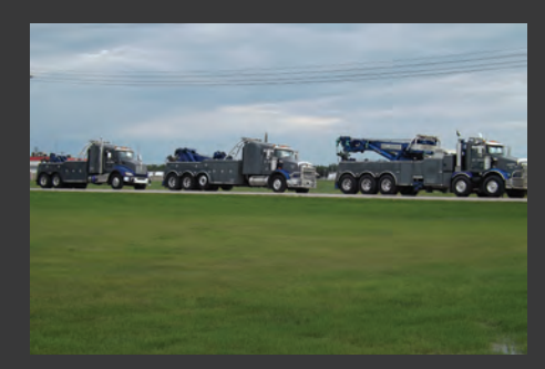
Special Olympics Truck Convoy